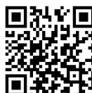
Spokane & Karski Educational Video