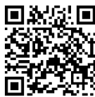
Spokane & Karski Educational Video