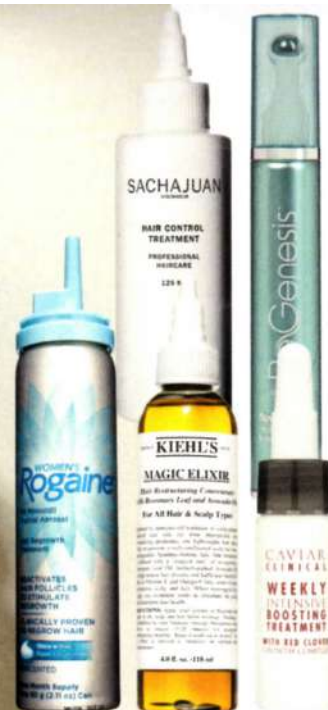
Clockwise from top: SACHAJUAN Hair Control Treatment revs follicles with microcirculation-boosting apigenin; panthenol, biotin, and niacinamide in REGENESIS Spot Serum target thinning areas with a user-friendly roller ball; ALTERNA Caviar Clinical Weekly treatment blocks the production of DHT, a hormone linked to hair loss; KIEHL'S Magic Elixir balances the scalp with botanicals; ROGAINE Foam, designed for women, delivers a daily dose of minoxidil.