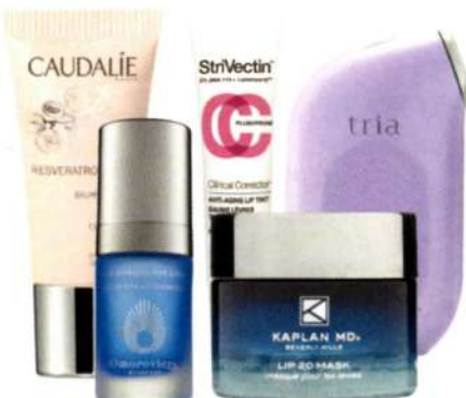
From left: A Harvard Medical School study found that the micro hyaluronic acid and resveratrol in CAUDALIE Resveratrol Eye Lifting Balm boost the skin's production of hyaluronic acid; rich in DNA-repairing peptides, OMOROVICZA Blue Diamond cream smooths lids; STRIVECTIN Clinical Corrector lip tint minimizes lines with repair-hormone-stimulating nicotinic acid; KAPLAN MD Lip 20 Mask resurfaces with papaya enzymes; in in-house trials, 85 percent of participants who used the TRIA Age-Defying Eye Wrinkle laser daily saw fewer lines around the eyes in eight weeks.

Counterintuitive as it may sound, plucking hairs might actually encourage a six-fold growth in new hair, according to a study out of the University of Southern California's Keck School of Medicine. When researchers selectively pulled 200 hairs, spaced up to 1 mm apart, from the backs of lab mice, the microinjury prompted an immune system response,