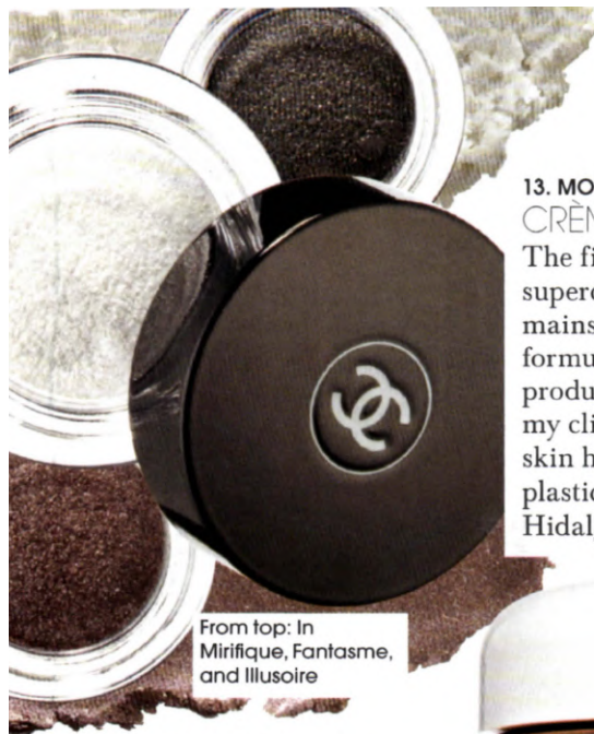
From top: In Mirifique, Fantasme, and Illusoire